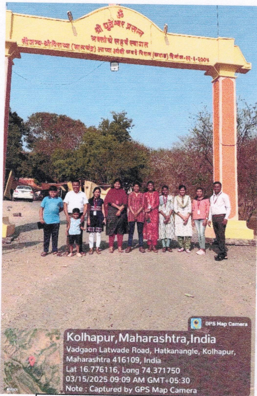
Dhuloba Temple, Alate