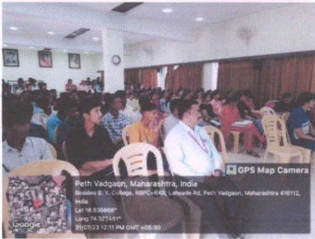
Peth Vadgaon, Maharashtra, India Besides B. Y. College, RBP0+6X8, Latwade Rd, Peth Vadgaon, Maharashtra 416112, India Lat 16.835666° Long 74.327491° 31/07/23 12:11 PM GMT +05:30