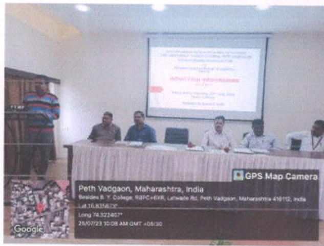
Peth Vadgaon, Maharashtra, India Besides B. Y. College, RBPC+6XR, Lathade Rd, Peth Vadgaon, Maharashtra 416112, India Lat 16.835677° Long 74.322467° 25/07/23 10:08 AM GMT +05:30