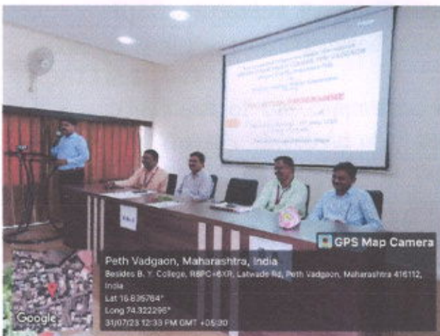
Peth Vadgaon, Maharashtra, India Besides B. Y. College, RBP0+6X8, Latwade Rd, Peth Vadgaon, Maharashtra 416112, India Lat 16.835704° Long 74.322295° 31/07/23 12:33 PM GMT +05:30