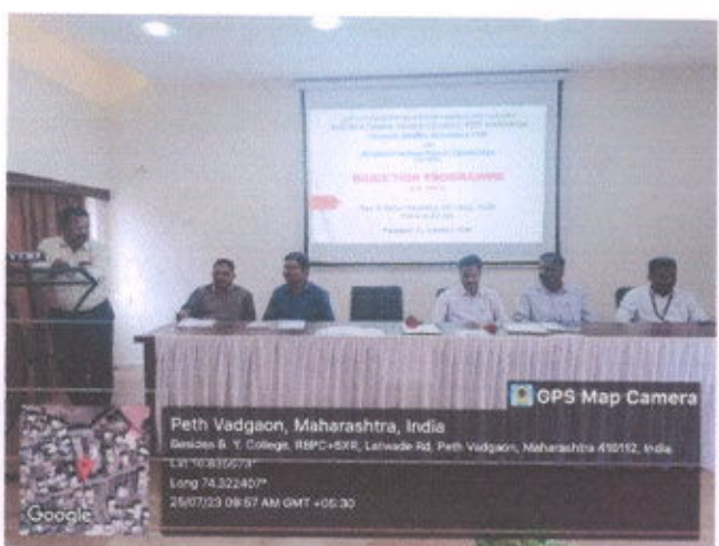
Peth Vadgaon, Maharashtra, India Besides B. Y. College, RBPC+6XR, Lathade Rd, Peth Vadgaon, Maharashtra 416112, India Lat 16.835677° Long 74.322457° 25/07/23 09:57 AM GMT +05:30