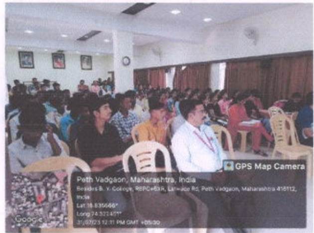
Peth Vadgaon, Maharashtra, India Besides B. Y. College, RBP0+6X8, Latwade Rd, Peth Vadgaon, Maharashtra 416112, India Lat 16.835666° Long 74.327491° 31/07/23 12:11 PM GMT +05:30