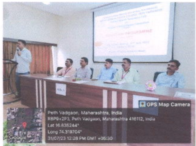
Peth Vadgaon, Maharashtra, India RBP9+2P3, Peth Vadgaon, Maharashtra 416112, India Lat 16.835244° Long 74.319704° 31/07/23 12:28 PM GMT +05:30