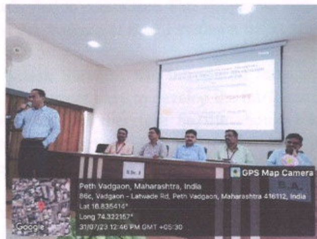
Peth Vadgaon, Maharashtra, India 96c, Vadgaon - Latwade Rd, Peth Vadgaon, Maharashtra 416112, India Lat 16.835414° Long 74.322167° 31/07/23 12:46 PM GMT +05:30