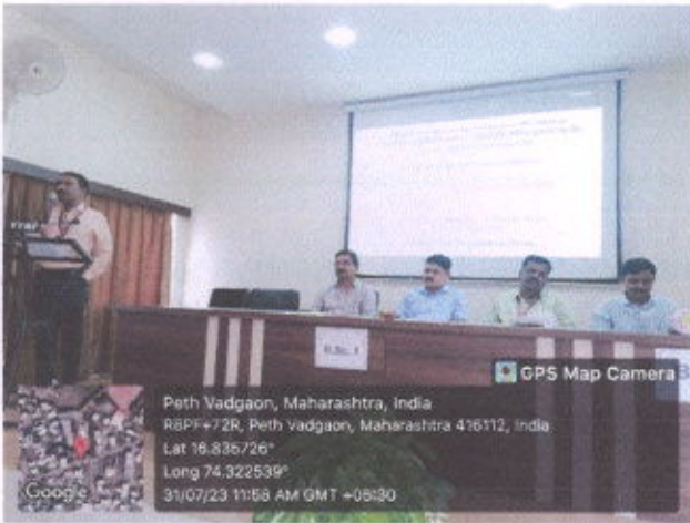
Peth Vadgaon, Maharashtra, India RBP7+72R, Peth vadgaon, Maharashtra 416112, India Lat 16.835726° Long 74.322539° 31/07/23 11:58 AM GMT +05:30