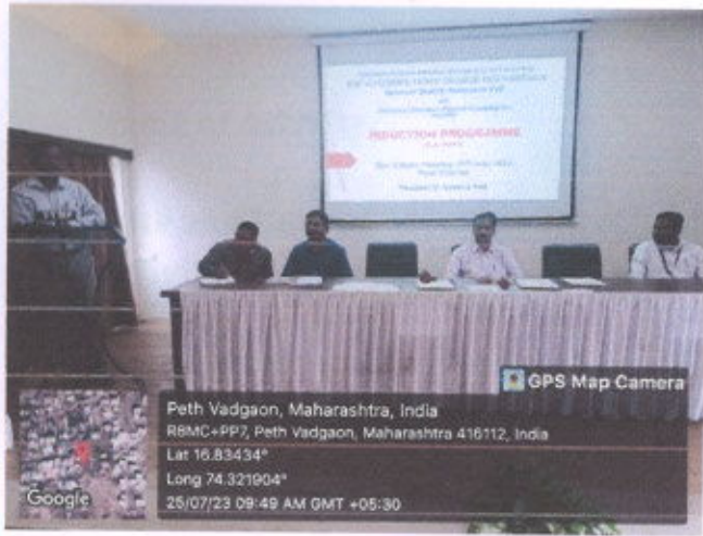
Peth Vadgaon, Maharashtra, India RBMC+9P2, Peth Vadgaon, Maharashtra 416112, India Lat 16.83434° Long 74.321904° 25/07/23 09:49 AM GMT +05:30