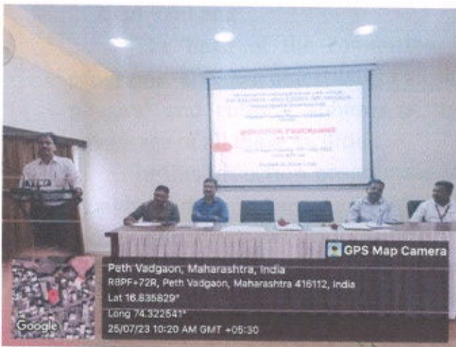
Peth Vadgaon, Maharashtra, India RBPF+72R, Peth Vadgaon, Maharashtra 416112, India Lat 16.835629° Long 74.322541° 25/07/23 10:20 AM GMT +05:30