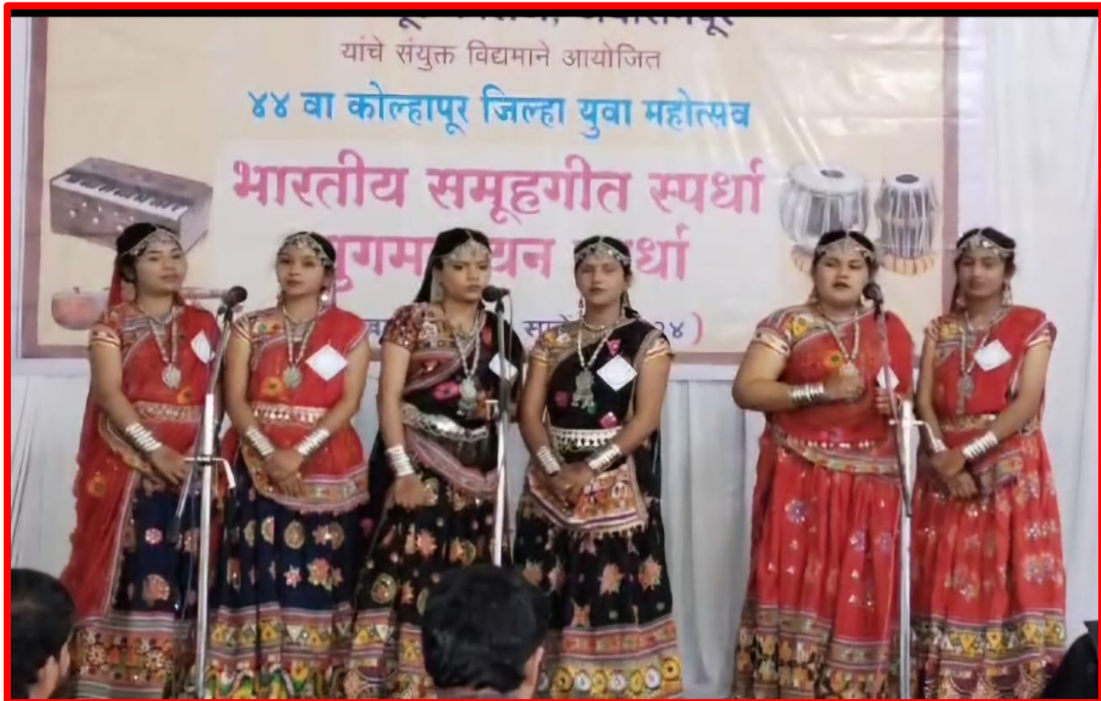
Students presenting Indian group song